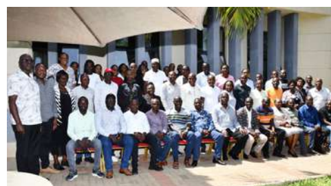
The speaker of the County Assembly, Members of the County Assembly staff of the County assembly service Service Board(CASB) and County Executives officials attending a joint strategic conference retreat involving Members of the County Assembly and County Executive officials held in Kisumu

teamwork and cooperation from Hon members and County Executive officials to enhance legislation, oversight, and representation. As he urged Hon Members to be well acquainted and informed about the County Assembly legislations whenever they appear before radio stations for interviews so that they give informed position of the issue under discussion.