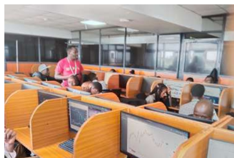
Second cohort participants of the Ajira program using computers in the County Assembly E-Library