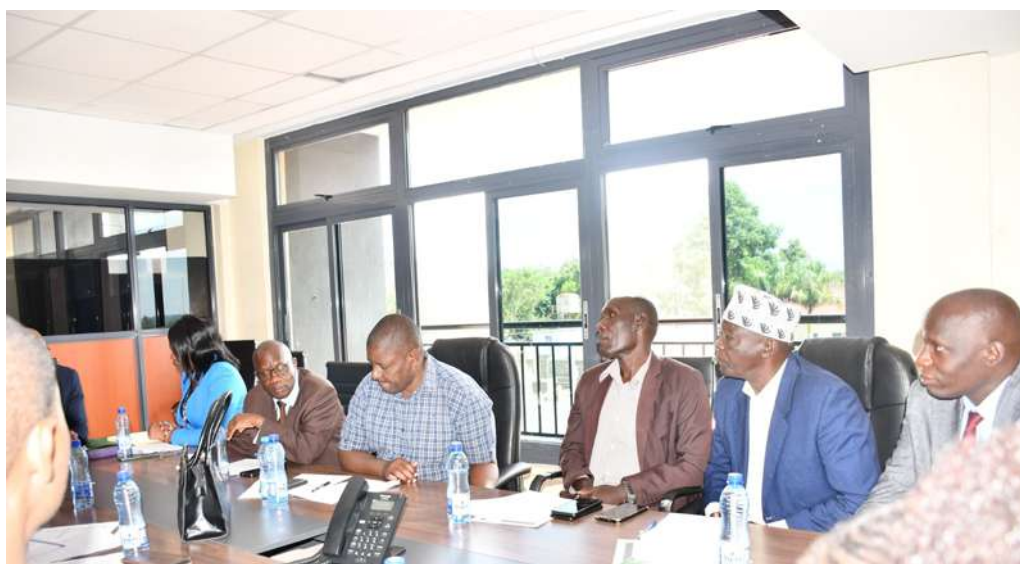
Members of the Committee on Finance and Economic Planning during an interrogation of the County Executive on financial statements for FY 23/24