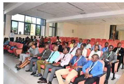
First cohort participants of the Ajira program listening to a presentation during an introductory training in the County Assembly Paskari Nabwana Hall

Note: Training programs in the County Assembly Library are open to the Assembly fraternity and the Bungoma County community at large. Members and staff are encouraged to take advantage of the opportunities to enhance digital skills and embrace emerging technological trends.