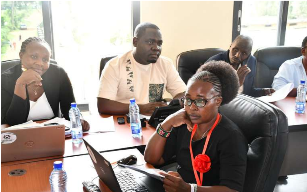
Members of the Committee on Roads, Transport and public Works during interrogation of financial statements for FY 23/24

These budget interrogation sessions are set to continue tomorrow, with final deliberations expected to conclude on Friday November 8th, 2024