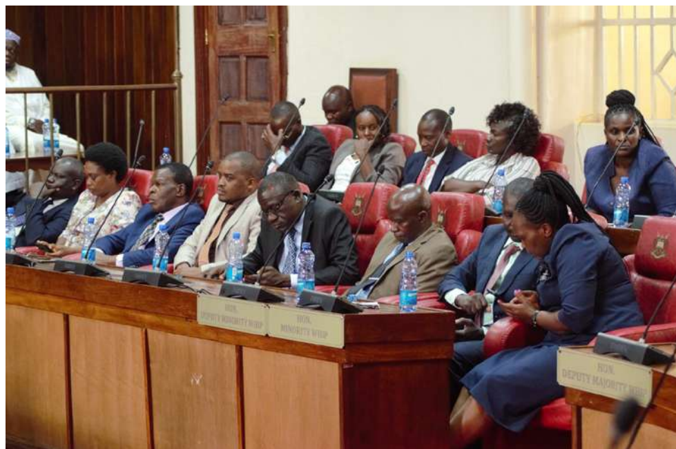
Members of the County Assembly of Bungoma attending a sitting at the County Assembly plenary