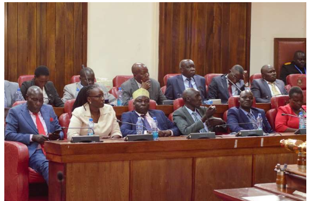
Members of the County Assembly of Bungoma attending a sitting at the County Assembly plenary

"We don't intend to have any business pending before the House by the time we close for the long recess. Let's mop up all pending business and ensure it is dispensed