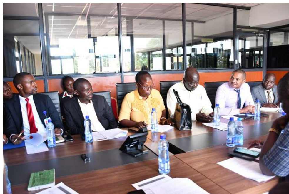
Members of the Committee on Finance and Economic Planning during an interrogation of the County Executive on financial statements for FY 23/24