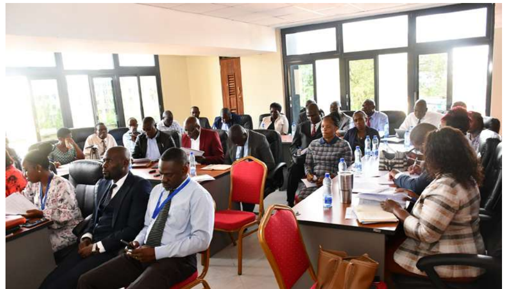
Members of the Committee on Agriculture, Livestock, Fisheries, Irrigation and Co-operatives during interrogation of the County Executive on financial statements for FY 23/24