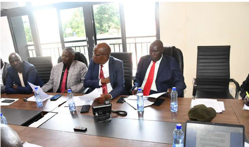
Members of the County Assembly during interrogation of Financial statements for FY 23/24